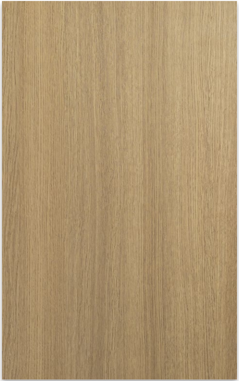
E210 – DOOR COUNTRY OAK