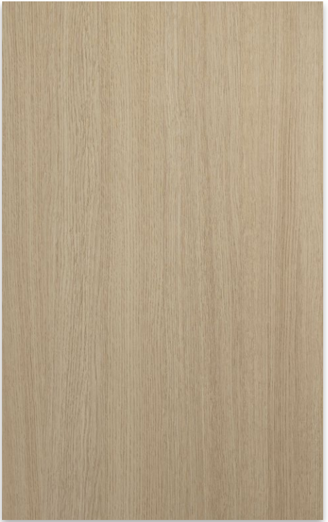
E210 – BATTLE CREEK OAK

Photographs and renderings in this brochure are for illustration and reference only. Actual wood and finish colors may vary due to printing process. Meridian Products always recommends ordering a sample door and/or drawer sample for accurate color selection and representation.